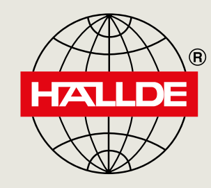
Food Preparation Machines Made in Sweden